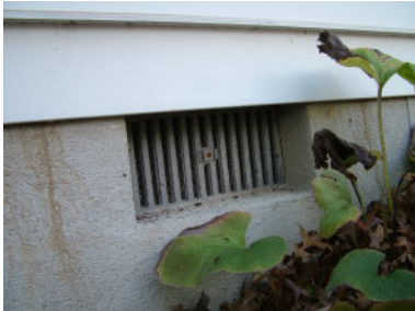
Crawl space vent