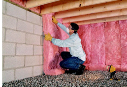
Proper installation (no vent)