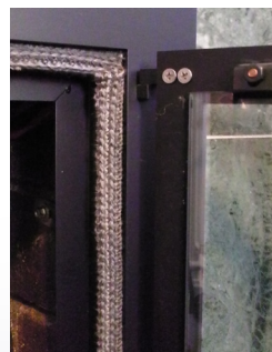
A fireplace with door gaskets