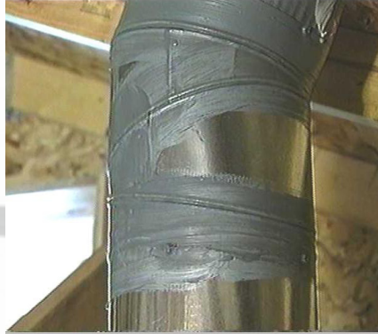
This duct has been sealed but not insulated