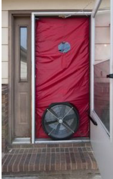
Blower door test

NOTE: The code requires new homes to be tested with blower doors, unless the air sealing in the home was inspected by a qualified and independent professional. Having a home professionally inspected and/or tested is an important safeguard for consumers to ensure that the home meets minimum energy code requirements. Builders can use blower door tests to verify the quality of the home. According to the code, tested air leakage must be less than "seven air changes per hour (ACH) when measured with a blower door at a pressure of 33.5psf (50Pa)". To standardize the test for different homes, the equipment used for the test is set at a standardized pressure level (33.5psf or 50Pa). Very efficient homes may have leakage rates of only .6-2.5 with a pressure of 50Pa.