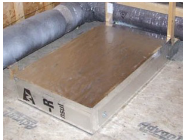
Insulated attic hatch and insulated ducts

Check the access hatches/doors for attics. These can be a major source of air leakage in the home, creating high utility bills and sending cool air up to the roof in the summer. Hatches/doors to the attic should be weather-stripped and insulated. They should be well-made so that they are airtight. The insulation should be attached so that it isn't damaged or become loose when the hatch or door is used. Test the air tightness by closing door or hatch on a piece of paper. Can the paper be easily pulled out when the hatch/door is closed? If yes, the door/hatch is not airtight and should be fixed.